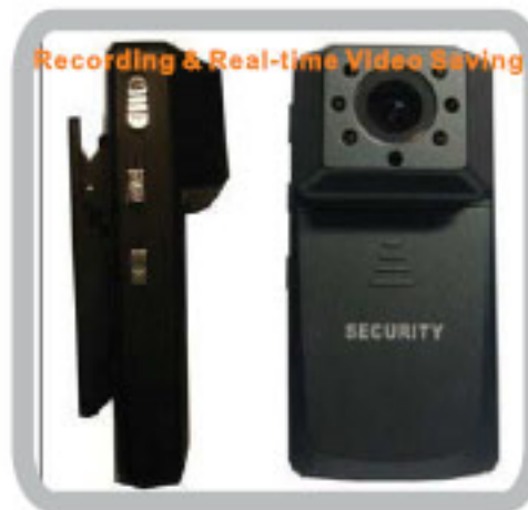
Recording & Real-time Video Saving

Designed for security guard & offers another crime fighting tool, enabling you to record the actions of the suspect. Video recordings can be used as evidence to prosecute those individuals who violate the law.