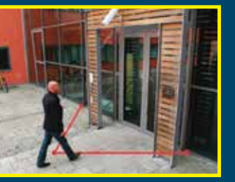
Detects someone walking up to a door