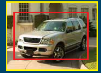
An car has been stolen off a driveway.