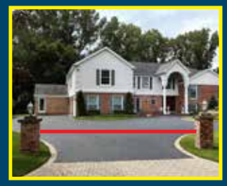
An intruder is walking into your drive way