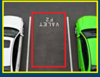
A car illegally parks in a space.