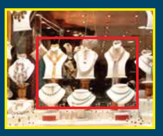
A valuable item is removed from a shelf