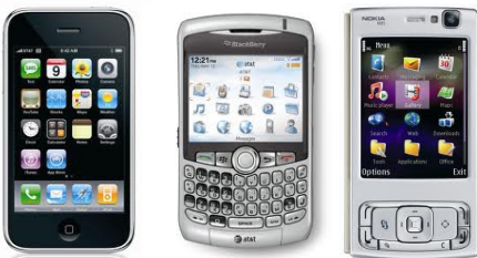
view online using your smartphone