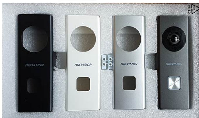
Comes with four different colours